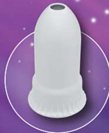
Anal Dilator Obturator