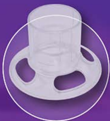
Clear Circular Anal Dilator

The Ultimate Haemorrhoidal Circular Stapler is supplied with the following 5 accessories: