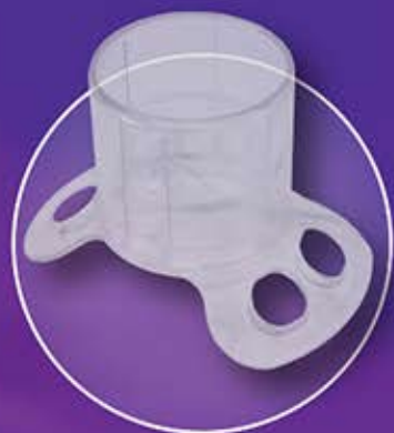
Clear Butterfly Anal Dilator