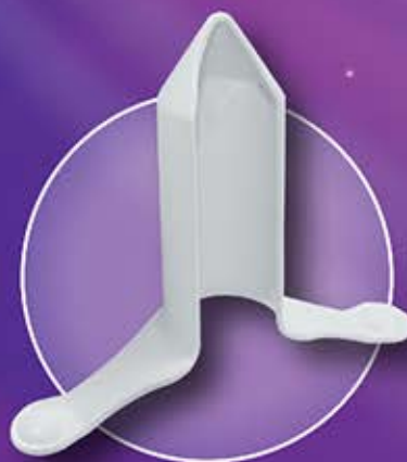
Purse-String Suture Anoscope